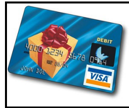
$10 VISA Gift Card