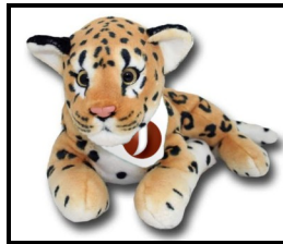
Jaxon the Jaguar (Our official mascot)